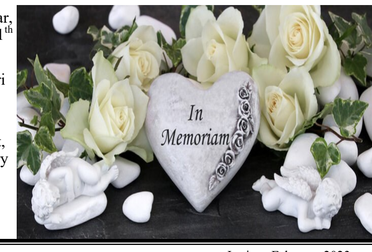
Jottings February 2023

We pray for God's comfort and peace on the grieving families.