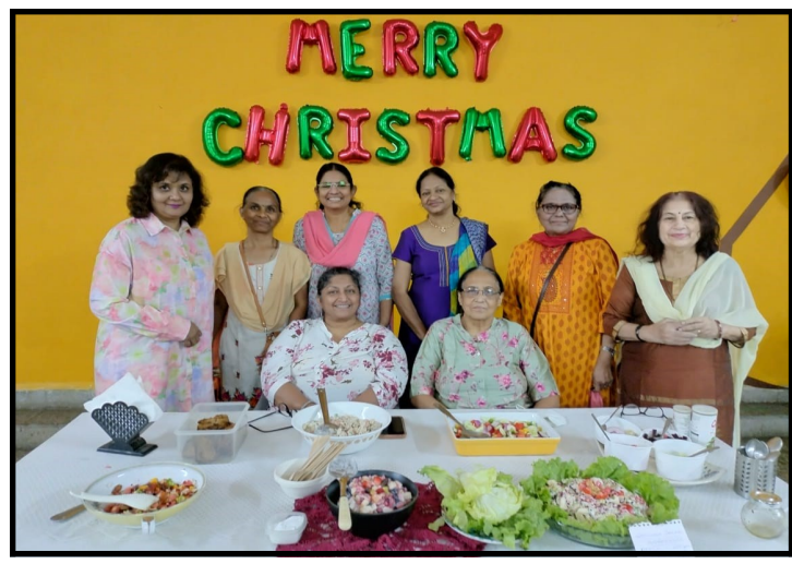
Borivali : 6 members with 2 guest attended meeting on 12th January. Devotion was led by Yvonne

Belapur: 8 members with 1 guest attended meeting on 4<sup>th</sup> January. Devotion was led by Gissy Jacob. A Salad demonstration was held. Members participated and it was huge success and all had enjoyable time. Members discussed to celebrate Valentine's Day.