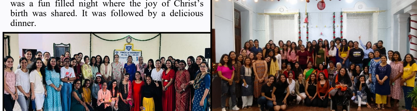
Jottings February 2023